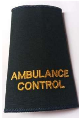
EMD/NEAC Call Taker