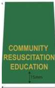
Community resuscitation Officer