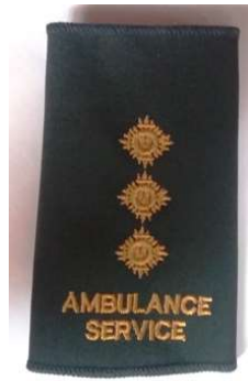
^ Station Officer Training Officer Control Officer