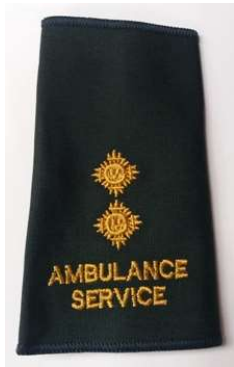
^ HALO & RNEMDA Officer