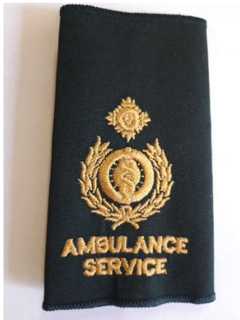
^ Area Manager