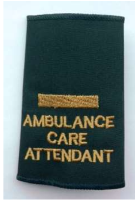
^ ACA Supervisor