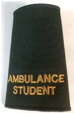
EMT (AAP) Student