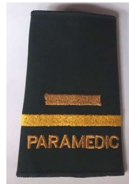
^ Paramedic Supervisor