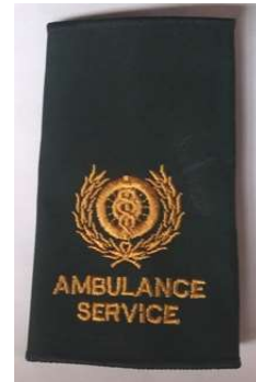
^ DCM (Duty Control Manager)